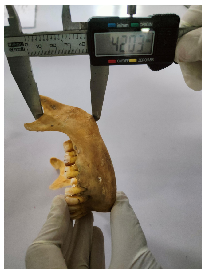
Figure 2: Measurement of height of ramus

The mean \pm SD for ramus height and breadth on the right side for females was 41.18 \pm 4.70 mm and 28.89 \pm 2.28 mm, respectively, while on the left side, it was 43.03 \pm 3.57 mm and 30.70 \pm 7.62 mm, respectively. For males, the mean \pm SD for ramus height and breadth on the right side was 47.34 \pm 2.88 mm and 33.14 \pm 3.26 mm, respectively, while on the left side, it was 47.39 \pm 3.88 mm and 32.39 \pm 3.85 mm, respectively. The p-value was statistically significant ( \leq 0.001) for ramus height on both sides and ramus breadth on the right side for males and females. However, the difference in ramus breadth on the left side between genders was not statistically significant. Males tend to have higher