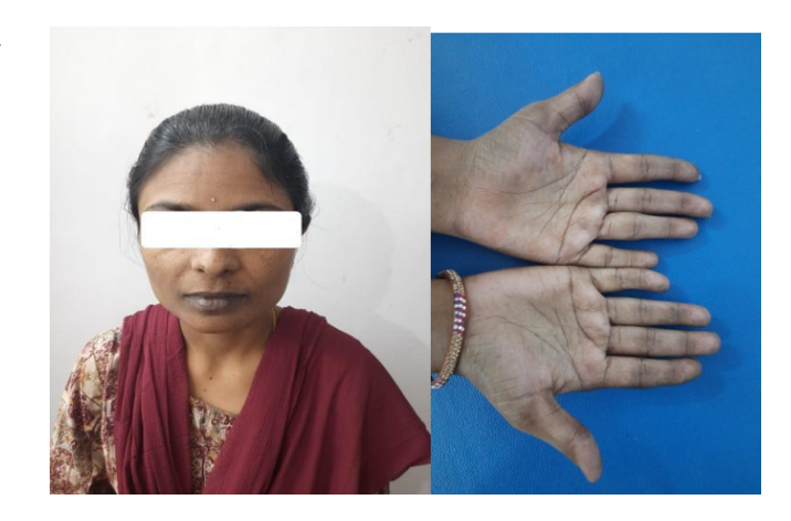
Figure 1: Hyperpigmentation of Lips and Palmar Creases

On general physical examination, the patient was conscious, alert, thin-built, appeared weak, and slightly dehydrated. Her pulse was 96 beats per minute (bpm) and low volume, and her blood pressure was 80/60 mmHg in the sitting position. Generalized hyperpigmentation was noted mainly on the lips, palmar creases, knuckles, elbows, and oral mucosa (Figure 1). However, no hyperpigmented or hypopigmented patches were observed. There was no thyromegaly, and the remaining physical examination findings and systemic examinations were normal.